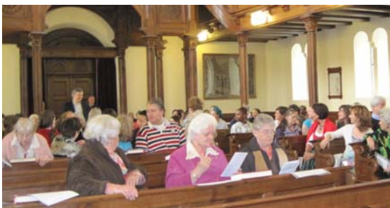
Easter Sunday listening as the visitors introduce themselves

On Maundy Thursday evening a small group gathered to join in an Agape meal featuring some food from biblical times, dates, figs, nuts, honey, pomegranates, grapes. We participated in communion as we shared food with one another and listened once more to the Story of Agape/Love in the Crucifixion of Jesus of Nazareth. There were 83 present including visitors New Zealand, USA, UK, Canada, Germany and Islands off Iceland when SICC gathered on Easter Sunday to celebrate the Resurrection of Jesus of Nazareth, the Risen Lord.